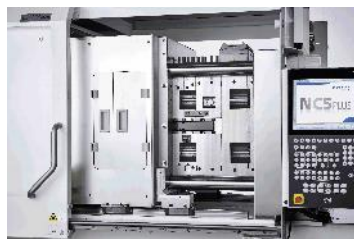
Image 4: The GMP-compliant layout of the IntElect S mould area protects against dust particles and ensures contamination-free production for medical moulders