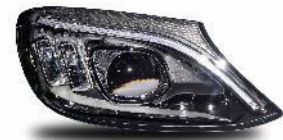
Image 3: Sumitomo (SHI) Demag will demonstrate the moulding of an LSR matrix light on an IntElect 130