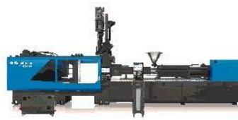
Image 5: The all-electric MultiPlug (vertical option pictured) offers an affordable option to switch to multi-component moulding